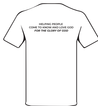
Option 2 Slogan