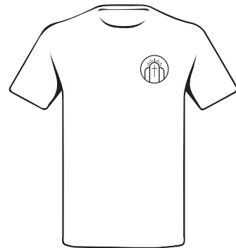
Option 3 Badge Logo