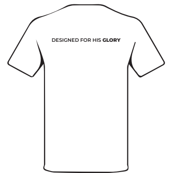
Option 4 Slogan 2