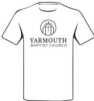
Option 1 Vertical Logo