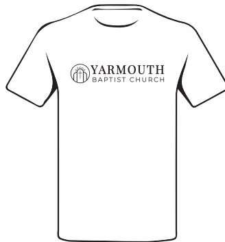
Option 2 Horizontal Logo