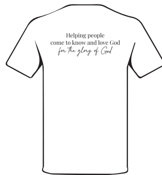
Option 3 Slogan in Script